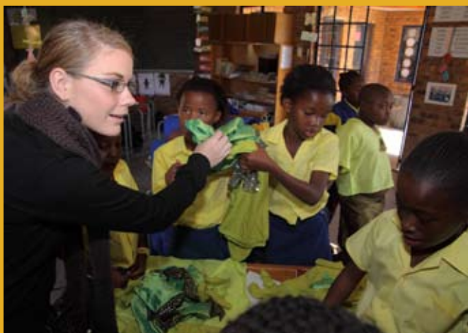
Die kostuums is deur lede van die Mamelodi gemeenskap gemaak.