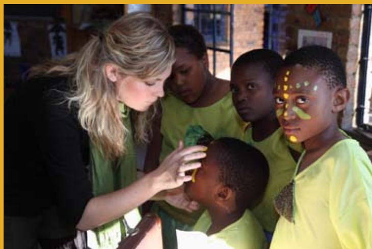
Studente het self gesorg vir die grimering van die leerders.