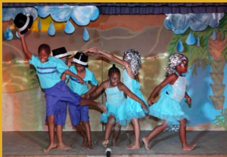
Die leerders het danspassies op bekende liedjies gedoen.