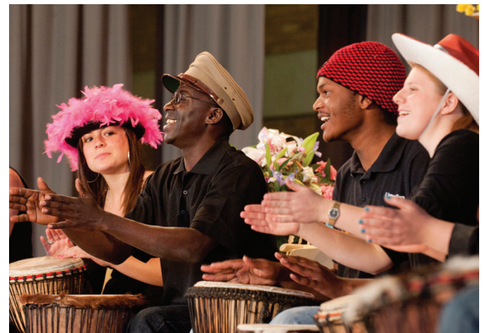
Students of the Edu-Cantare choir play a huge role in creating a new culture among staff and students.