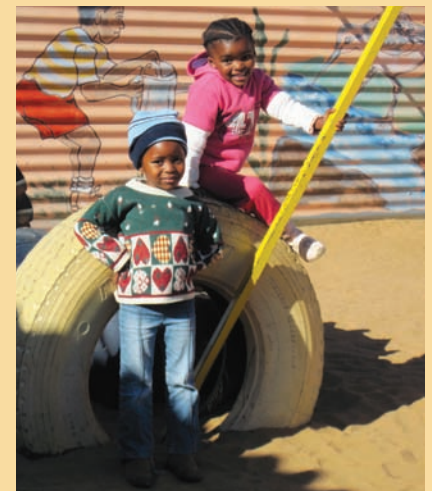
Learners benefit from the Ntataise project.