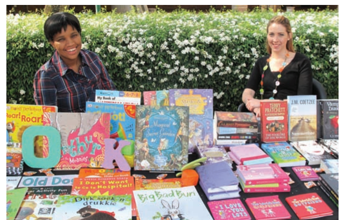
Students display books at the Literacy Day celebrations.