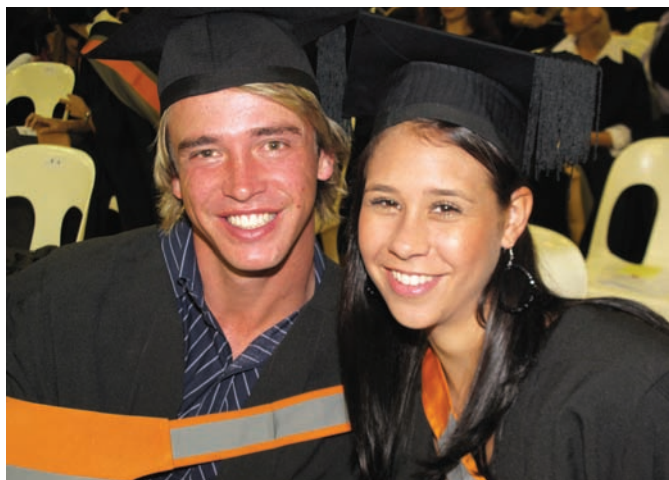
At the September graduation ceremonies of the Faculty of Education, 21 BEd degrees; eight Honours degrees; two Master's degrees and three PhD degrees were conferred upon contact education students.