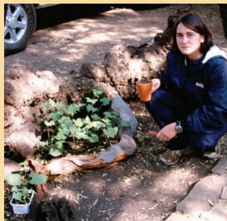
Nurturing the beans takes a lot of dedication.

The idea behind the project was for students to experience the relation between humans and plants. It taught the students to assist learners to climb the ladder of life, step by step, in order to reach their goals.