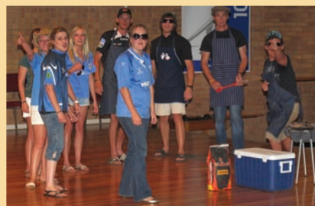
Die studente maak jaarliks 'n groot sukses van die musiekblyspel en geniet dit net soveel soos die gehoor.

Die groepe is deur drie mense beoordeel. Hierdie jaar was die produksies van besondere hoë gehalte. Die studente was entoesiasies en het baie moeite gedoen. Dit saam met die opgewonde atmosfeer wat daar geheers het, is 'n bewys dat hierdie aktiviteit een van die hoogtepunte van die derdejaars se opleiding in die taalklas is.