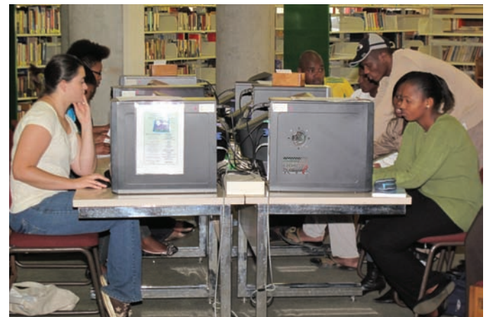
Students have full access to computers in the Education Library. Each student is issued with computer online time during registration which they can replenish during the year.