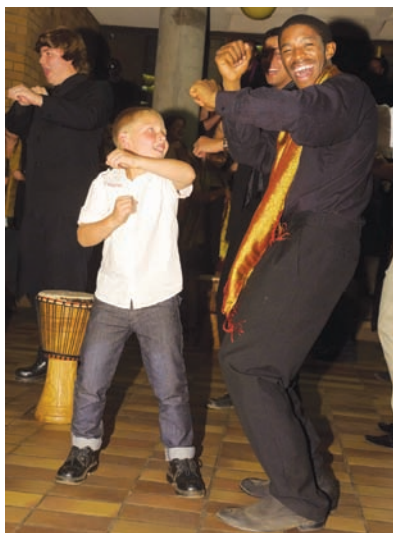
Afterwards the singing and dancing continued in the foyer of the Auditorium.