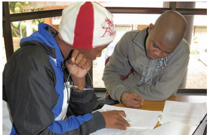
Students in the Faculty take their studies seriously.