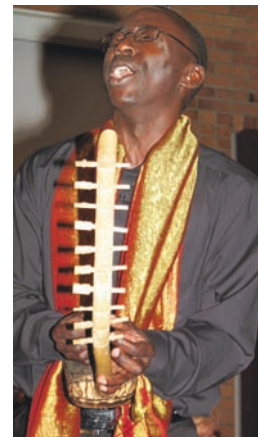
Entertainment on a traditional African musical instrument