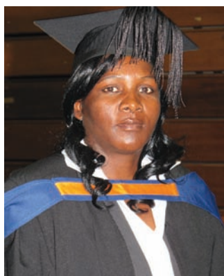
The Faculty of Education has 21 000 registered Distance Education students.