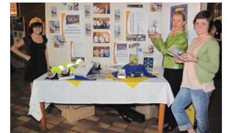
Students and staff showed their community projects through exhibitions.