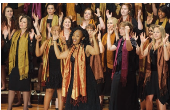
Edu-Cantare Choir celebrating life