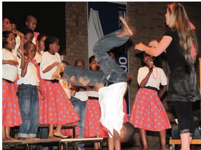
Learners from Edendale Primary School in Mamelodi entertained the audience.