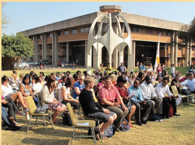
Students promoted reading through attending the Literacy Day celebrations.