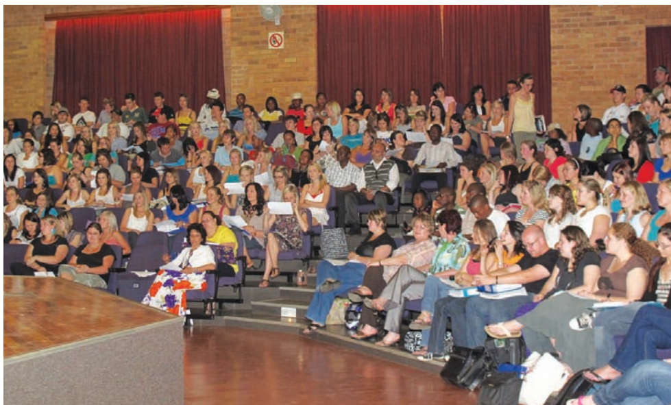
An audience of 400 students and staff members attended the celebrations in the Auditorium.