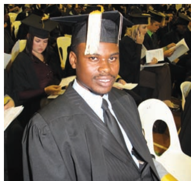
A total of 1 822 Distance Education students received qualifications during the September graduation ceremonies in Pretoria, Nelspruit, Polokwane, Durban and East London.