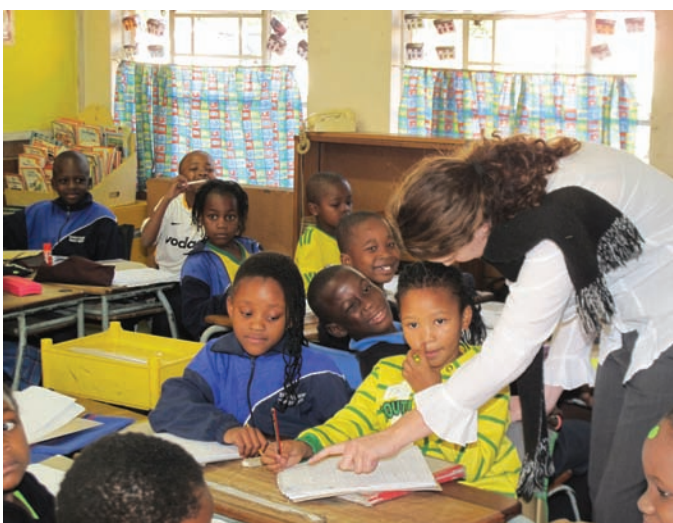
A student during Teaching Practice at Sunnyside Primary School