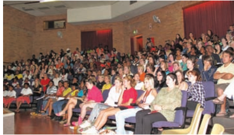
Staff and students turned up in their masses to attend the Community Engagement Day celebrations.