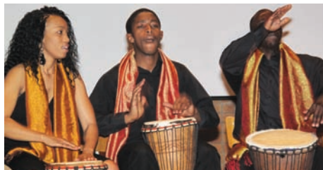
A drumming item from members of the Edu-Cantare Choir