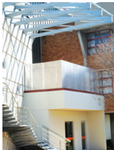
Aldoel 3 Lecture Theatre features a modern staircase