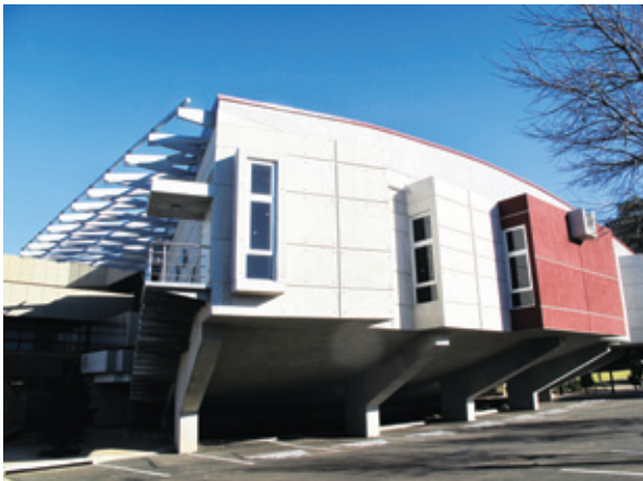
Aldoel 1 Lecture Theatre seats 400