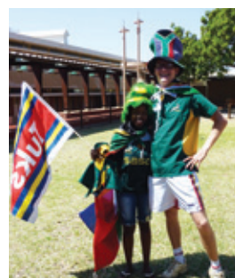
Dressing up for a special occasion