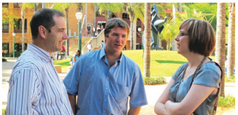
Guests enjoyed the environment of the campus