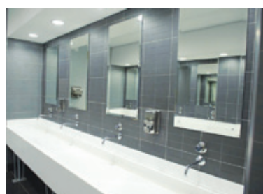
New bathrooms have state-of-the-art fittings