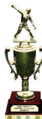
Winners of the Inter-residence Cricket Trophy