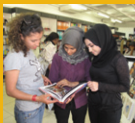
P 4 New shops create new opportunities