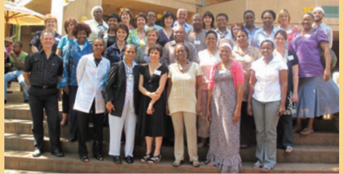
Staff of the Department of Early Childhood Education and delegates from different universities had discussions to strengthen existing early childhood programmes.

receive feedback from the co-ordinators of the research focus areas and, at this workshop planned research activities for 2012.