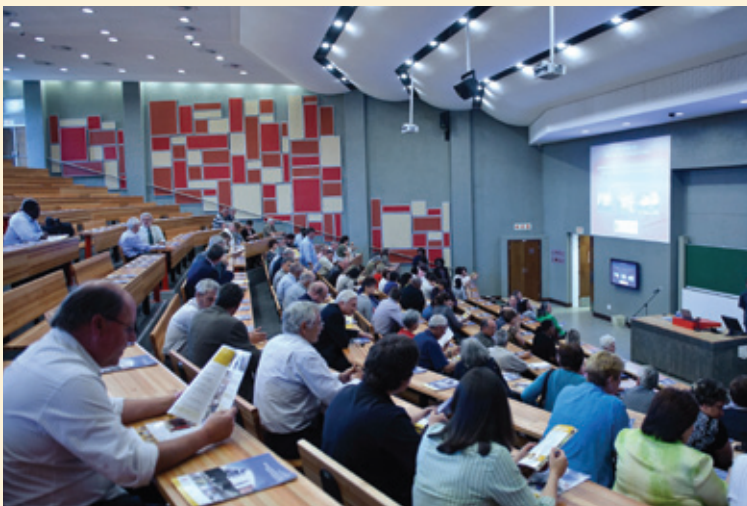
Guests attended a presentation in the Aldoel 1 Lecture Theatre.