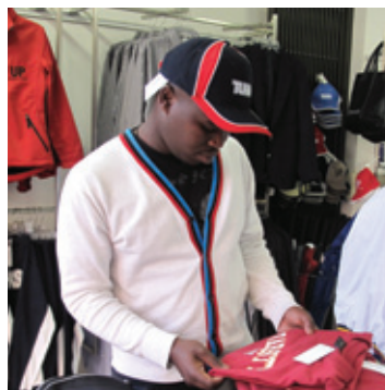
A student browses the new Wannabee Shop