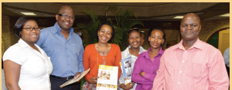
Staff from the Department of Education Management and Policy Studies enjoyed the official opening of the new buildings.