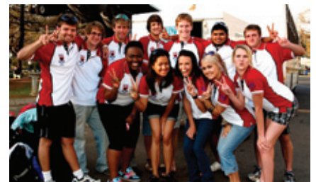
Sports fever reigns