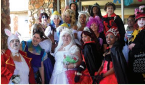
The Wonderland visitors arrive at their destination

The Secretaries in the Faculty were all dressed up in the exotic divine outfits to suit the 'Alice and the Mad Hatter in Wonderland' theme of the University of Pretoria Secretaries' year-end function on 7 October 2011. The event was held at the Stone Cradle Restaurant at Rietvlei Nature Reserve. The highlight of the event was the limousine in which they travelled to Irene.