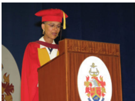
Prof Philomena Essed

The Unit for Distance Education presented four spring graduation ceremonies. On 14 September 2011, two ceremonies were held in Polokwane. Five hundred and eighty-seven students graduated, of which 360 were awarded the Advanced Certificate in Education (ACE) and 227 received a BEd (Hons) degree. On Friday, 16 September 2011, two ceremonies were presented in Nelspruit. A total of 279 students graduated, of which 145 were ACE and 134 BEd (Hons) students. On Wednesday, 21 September, the Distance Education a graduation ceremony took place in East London. One hundred and twenty-six students graduated of which were 72 ACE and 54 BEd (Hons) students. On Friday, 23 September, the final graduation ceremony was presented in Durban. Two hundred and sixty-six students graduated of which 153 were ACE and 113 BEd (Hons) students.