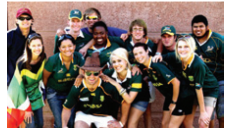
Life is exciting and adventurous