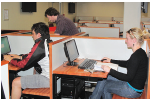
Students benefit from the new computer laboratories