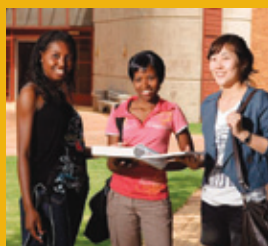
P 20 Education is the best career choice