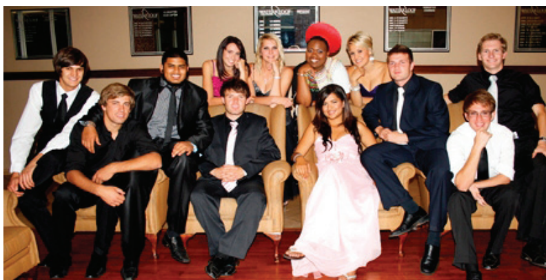
Jakarandia House Committee poses at the Annual year-end Dinner