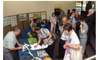
Staff and guests enjoyed the publisher exhibitions