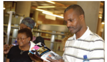
Many scholarly books were on display