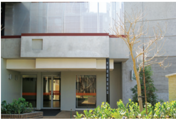
Northern side of the Aldoel 1 Lecture Theatre blends surfaces of various textures