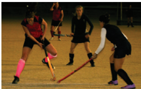
A womans hockey match played with fervour