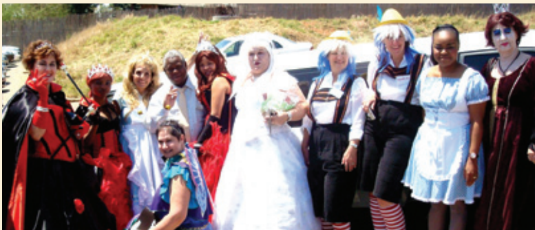
The women travelled in a limousine to the event