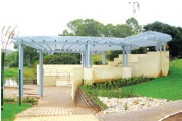
The boma (amphitheatre) integrates modern design principles