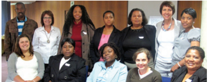
Trainers in a pilot project of Ntataise seen with staff from the Department of Early Childhood Education

During the feedback session the trainers reported on the practitioners' implementation of the materials as they are the ones that are teaching in the early learning centres. Difficult activities were highlighted as well as illustrations that are problematic. They reported that the parents could see their children's progress clearly for the first time and that the assessment of the children's knowledge and skills was now easy to assess using the workbooks.