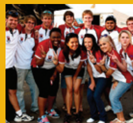
P 15 Jakarandia alive and well