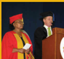
P 13 Spring Graduation a glorious event