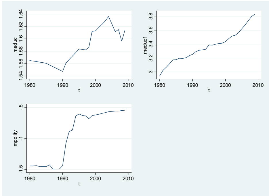
Figure 1: Education and Democracy, SADC, 1980-2009. Sources: World Development Indicators and Polity IV.

Moreover, in Table One we present the correlation matrix of the variables used. Initially, the two variables for education are, as expected, positively and significantly correlated to each other. However, the correlation between them is not terribly strong, which suggests that these variables are actually picking up different effects ( i.e. , the number of teachers per pupils can be seen as a proxy capturing quality of education and secondary enrollment, for being a head count, is probably capturing quantity of education).