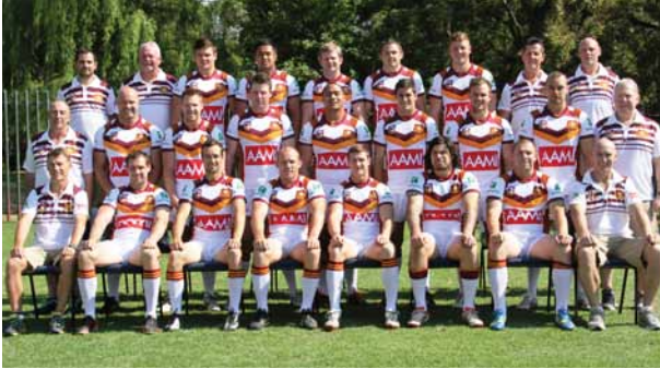
Australian Rugby League