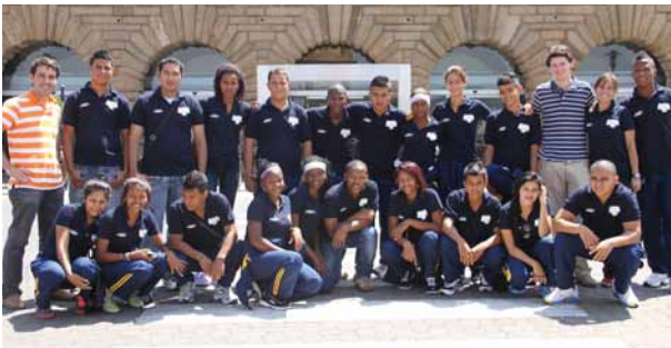
Columbia Rugby Team