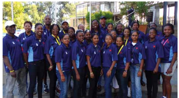
Trinidad and Tobago Ladies Cricket