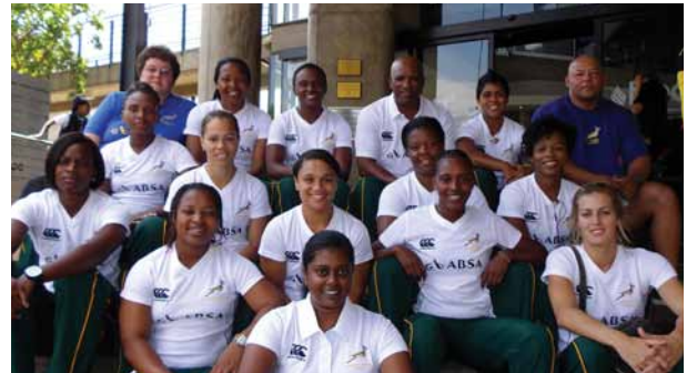
Springbok Women Sevens