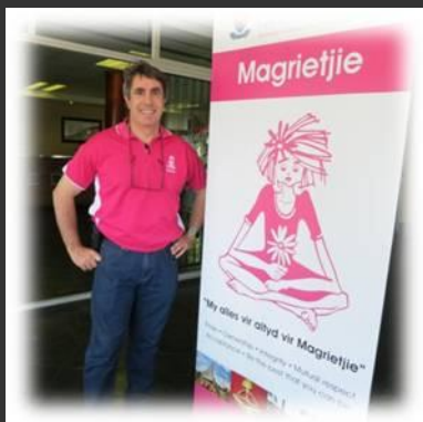
Papa Pink at our Magrietjie banner during last year's Golf Day!

GrietGriet is ook beskikbaar in Afrikaans - laat weet ons asb indien u 'n Afrikaanse weergawe verkies.