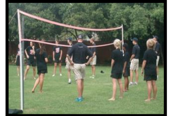
Above: Sport with Olienhout & Sonop