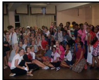
Left: "Old age home" social with Taibos