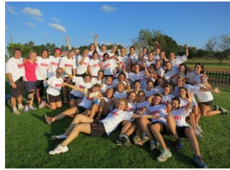
1 st Place : Drastoel 2013

Not yet even one day part of Magrietjie, and our new Spikkels show the rest of TUKS just how great their “pink-passion” is. On 26 January 2013, during the official welcoming function presented by TUKS for all residence first year students, the first years competed in a war cry competition. The Spikkels of Magrietjie ruled the day by taking first place. As their prize, every Spikkel received a free pizza, sponsored by TuksRes. We are soooo proud of our Spikkels who, since then, continues to excel on all levels!