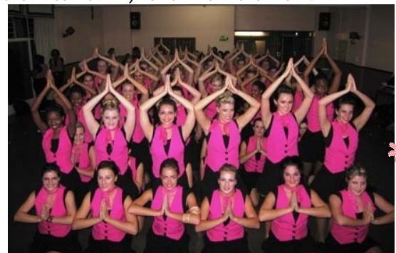
Serrie: 3 rd place in final