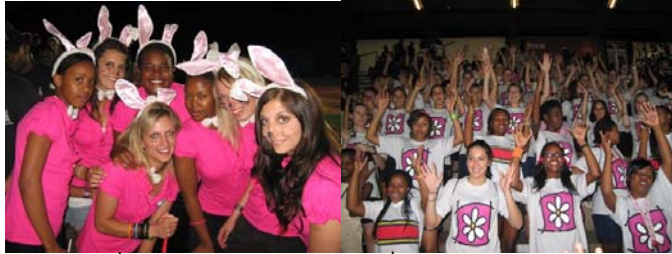
1 st place: Spirit Cup & 2 nd place: Athletics

After a very successful orientation week, the Spikkels continued their awesome participation in high spirits at the Ienk Athletics. Magrietjie won the Spirit Cup (3 rd year in a row) and also obtained 2 nd place in Athletics overall (with the dailies in 1 st place). Mags definitely raised the overall spirit of the evening when one Spikkel unexpectedly decided to 'huppel', instead of run, the 100 meter sprint!