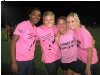
1 st place: HK relay

A further highlight of the event was when Magrietjie's HK surprised all the other HKs when they won the relay with an astounding performance! More proof that Magrietjie ladies are very versatile!