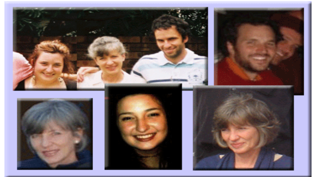
First house mother with her family today