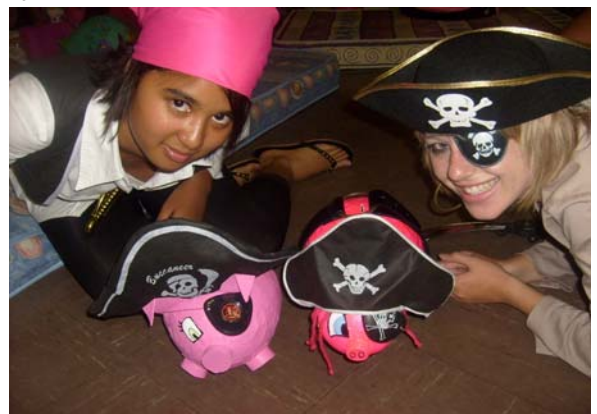
(top) Two enthusiastic Spikkels with their Piggies

Every year, as part of the fundraising initiative of the Rag HK, we have a Grietjie Piggy competition. This entails that each Spikkel has to make her own piggy bank and fill it with change. Each Spikkel and her piggy are then invited to the Grietjie Piggy fashion parade where both owner and piggy have to exhibit their theme on the catwalk. There were various category winners such as the heaviest piggy, best dressed piggy and the most original piggy. A total of R9000 was raised for RAG through this fun event.