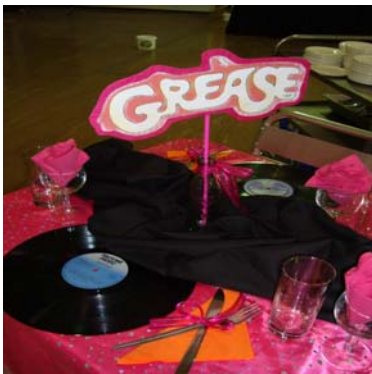
(left) Example of a table decorated according to the Grease theme

It was that time of the year again... time for the annual Magrietjie Informal. With the theme "a night at the theatre", the girls were inspired to dress up according to a Broadway or West-end show. Magrietjie's dining hall was graced by the likes of Sweeny Todd and wife, the full cast of Moulon Rouge and many others. The evening ended in true Magrietjie style with Narcotic playing in the background whilst the girls sang their favourite song to their hearts' content.