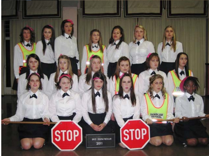
Magrietjie Serenade at the finals