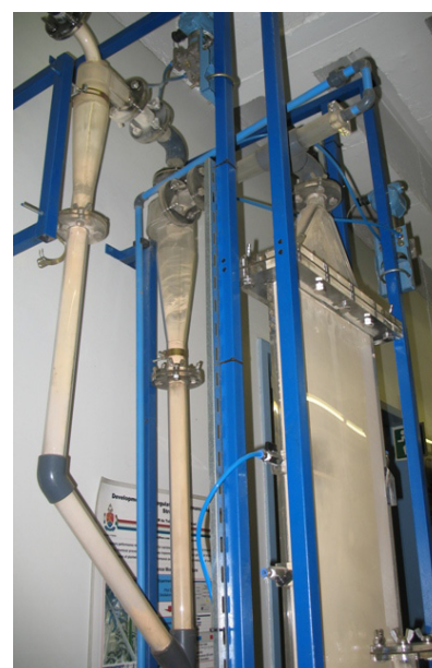
→ Catalyst circulation above the dense bed section.