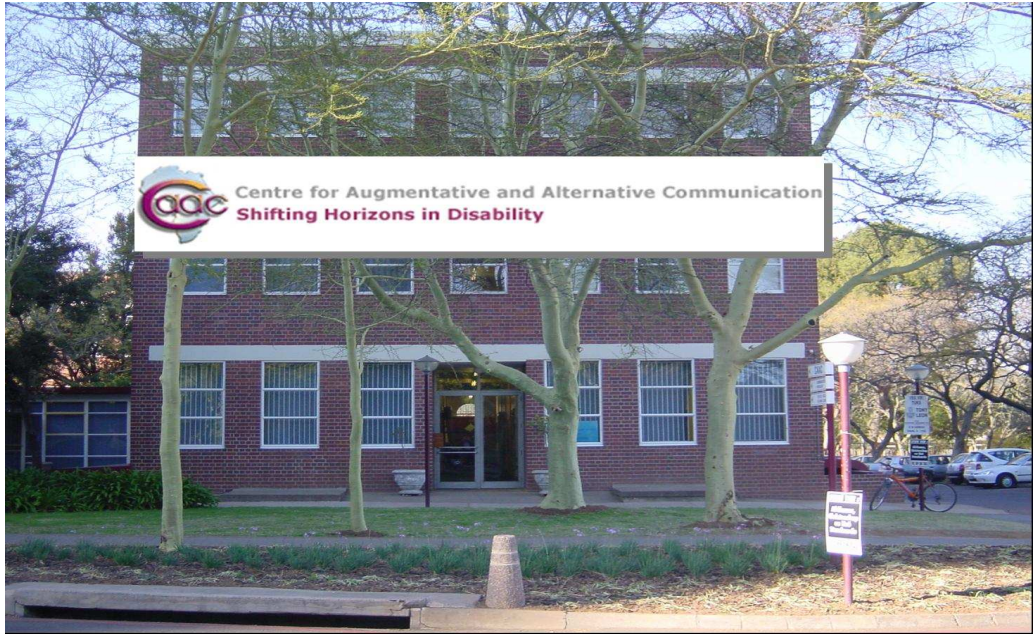
CENTRE FOR AUGMENTATIVE AND ALTERNATIVE COMMUNICATION, MAIN CAMPUS, LYNNWOOD ROAD, UNIVERSITY OF PRETORIA