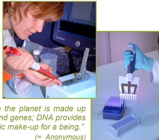
All life on the planet is made up of DNA and genes; DNA provides the genetic make-up for a being. (= Anonymous)

Department of Genetics University of Pretoria Private Bag X20, Hatfield PRETORIA, 0083 South Africa